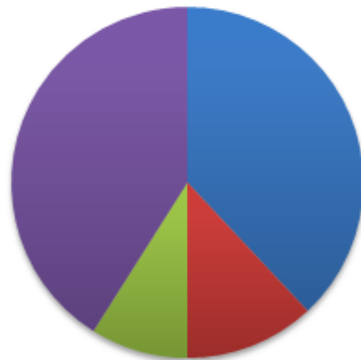
■ Toray ■ Teijin ■ MCH ■ Remainder